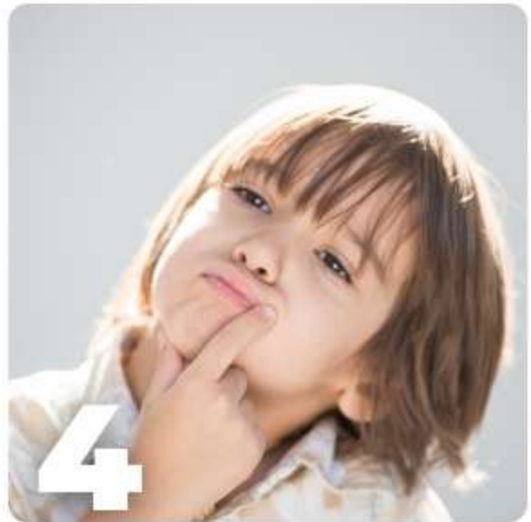
FREE STAY FOR KID UPTO THE AGE OF 14.99