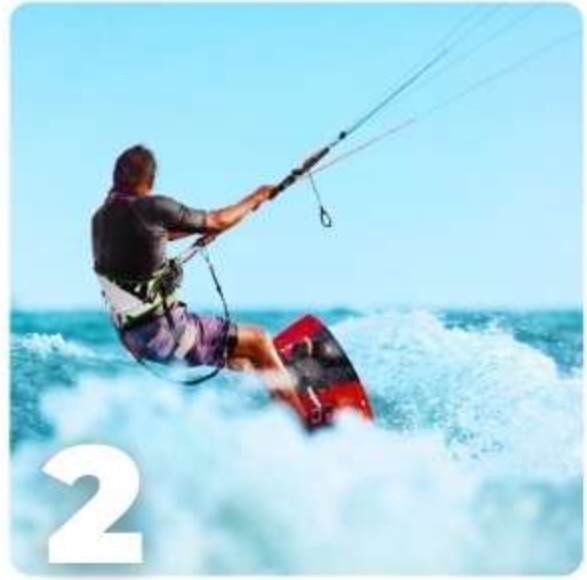
WORLD CLASS WATER SPORTS