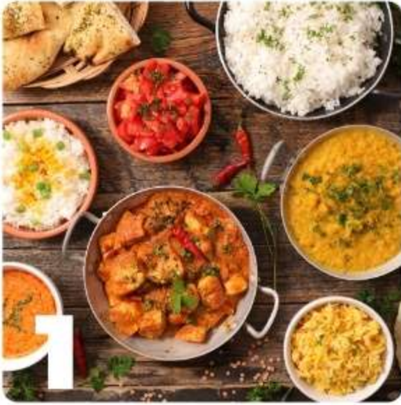
AUTHENTIC INDIAN FOOD