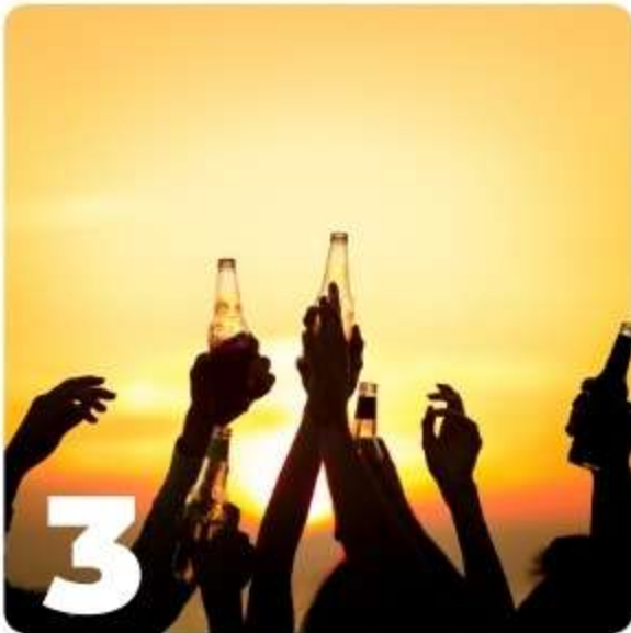
WEEKLY BEACH PARTIES